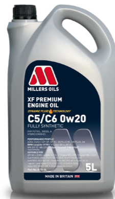
C5/C6 0w20 Code 8175

For use in petrol and hybrid engines. A premium gasoline engine oil formulated using the latest technology for OEM applications requiring a 0w16 viscosity, which provides protection against low speed pre-ignition (LSPI) and timing chain wear. Ideally suited for Honda, Lexus, Nissan, Suzuki, Toyota and other Asian manufacturers.