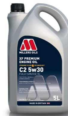
C2 5w30 Code 6229

Mid SAPS, for use in petrol, diesel and hybrid engines. A premium engine oil formulated using the latest technology for OEM applications requiring a C2 0w30 viscosity, predominantly for PSA group applications including Peugeot, Citroen and DS.