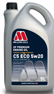
C5 ECO 5w20 Code 7779

Mid SAPS, for use in petrol, diesel and hybrid engines. A premium OEM approved engine oil* formulated using the latest technology for applications requiring a C5 0w20 viscosity designed for Volkswagen Audi Group (VAG) including Bentley, Seat, Skoda and Porsche.