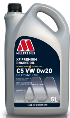
C5 VW 0w20 Code 8049

Low SAPS, for use in petrol, diesel and hybrid engines. A premium manufacturer acknowledged engine oil formulated using the latest technology for OEM applications requiring a C1 5w30 viscosity, predominantly for Land Rover/Range Rover vehicles fitted with Diesel Particulate Filters (DPF).