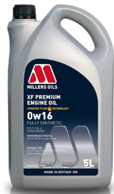
0w16 Code 8174

For use in petrol and hybrid engines. A premium gasoline engine oil formulated using the latest technology for OEM applications requiring a 0w16 viscosity, which provides protection against low speed pre-ignition (LSPI) and timing chain wear. Ideally suited for Honda, Lexus, Nissan, Suzuki, Toyota and other Asian manufacturers.