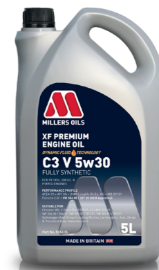
C3 V 5w30 5862

Mid SAPS, for use in petrol, diesel and hybrid engines. A premium OEM approved engine oil formulated using the latest technology for applications requiring C2 or C3 5w30 viscosities. Covering European manufacturers including BMW, Mercedes Benz and GM dexos 2 applications.