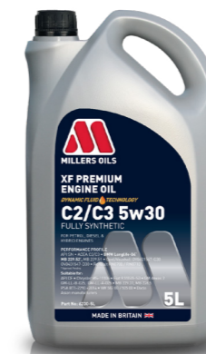
C2/C3 5w30 Code 6230

Mid SAPS, for use in petrol, diesel and hybrid engines. A premium engine oil formulated using the latest technology for OEM applications requiring a C2 5w30 viscosity, predominantly for PSA group applications including Peugeot, Citroen and DS.