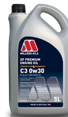
C3 0w30 Code 7998

Mid SAPS, for use in petrol, diesel and hybrid engines. A premium manufacturer acknowledged engine oil formulated using the latest technology for OEM applications requiring a C2 0w30 viscosity, predominantly for Ford and Jaguar Land Rover.