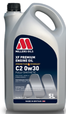
C2 0w30 Code 7997

Mid SAPS, for use in petrol, diesel and hybrid engines. A premium manufacturer acknowledged engine oil formulated using the latest technology for OEM applications requiring a C5 5w20 viscosity, introduced for Ford Eco-Boost petrol engines and Jaguar Land Rover.