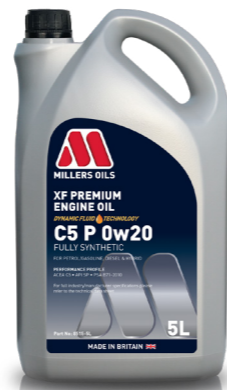
C5 P 0w20 8515

Mid SAPS, for use in petrol, diesel and hybrid engines. A premium OEM approved engine oil* formulated using the latest technology for applications requiring a C5 0w20 viscosity. Designed predominantly for BMW, Ford, Jaguar Land Rover, Opel/Vauxhall, Volvo and Asian manufacturers.