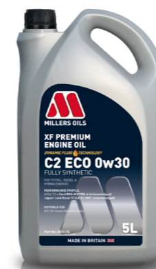
C2 ECO 0w30 Code 8045

Mid SAPS, for use in petrol, diesel and hybrid engines. A premium engine oil formulated predominantly for the PSA group including Peugeot, Citroen & DS and other Stellantis group manufacturers including Opel and Vauxhall.