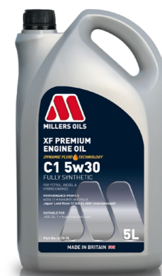
C1 5w30 Code 6228

Mid SAPS, for use in petrol, diesel and hybrid engines. A premium VW 504 00 / 507 00 OEM approved engine oil formulated using the latest technology for applications requiring a C3 0w30 viscosity, designed for Volkswagen Audi Group (VAG) including Lamborghini, Seat, Skoda and Porsche.